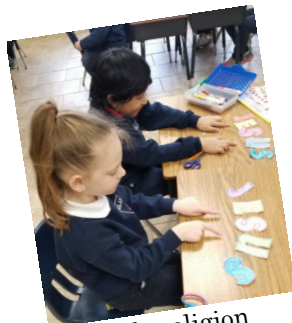
1st grade religion class